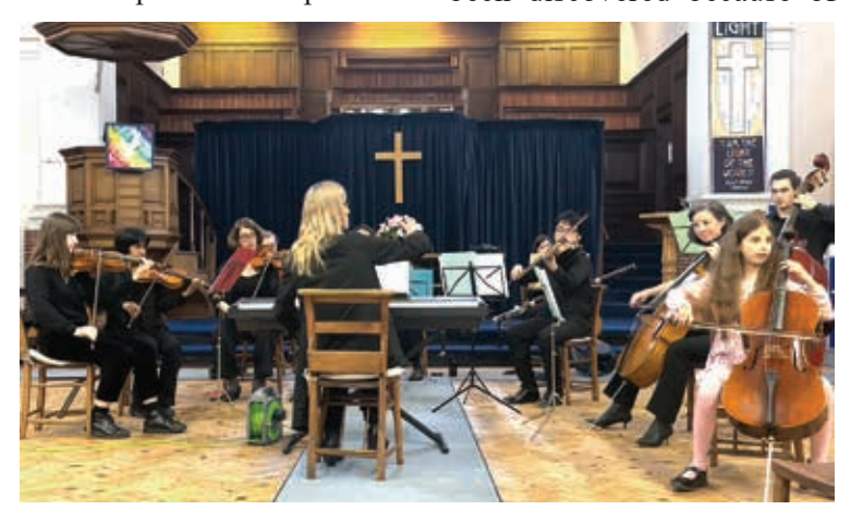
Special programme: The Youth Music Centre orchestra

Some of the pieces they will play have only recently been discovered because of