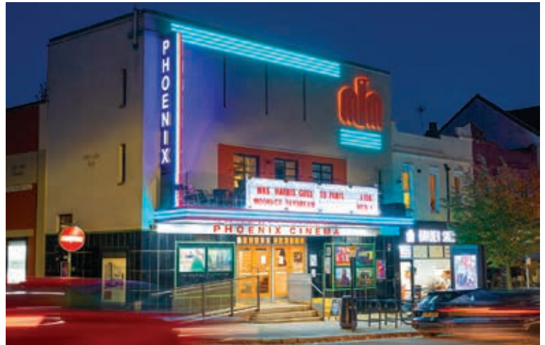
Tough times: The Phoenix needs support

Residents living in and close to Southern Road, N2, were surprised to receive a hand-delivered leaflet last month from a property company outlining plans for redevelopment of the nearby Fortis Green Tennis Club. Read the full story on page 2.