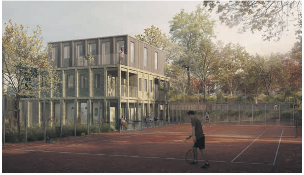
Courtside homes: Architect's drawing of how the tennis club grounds could look.