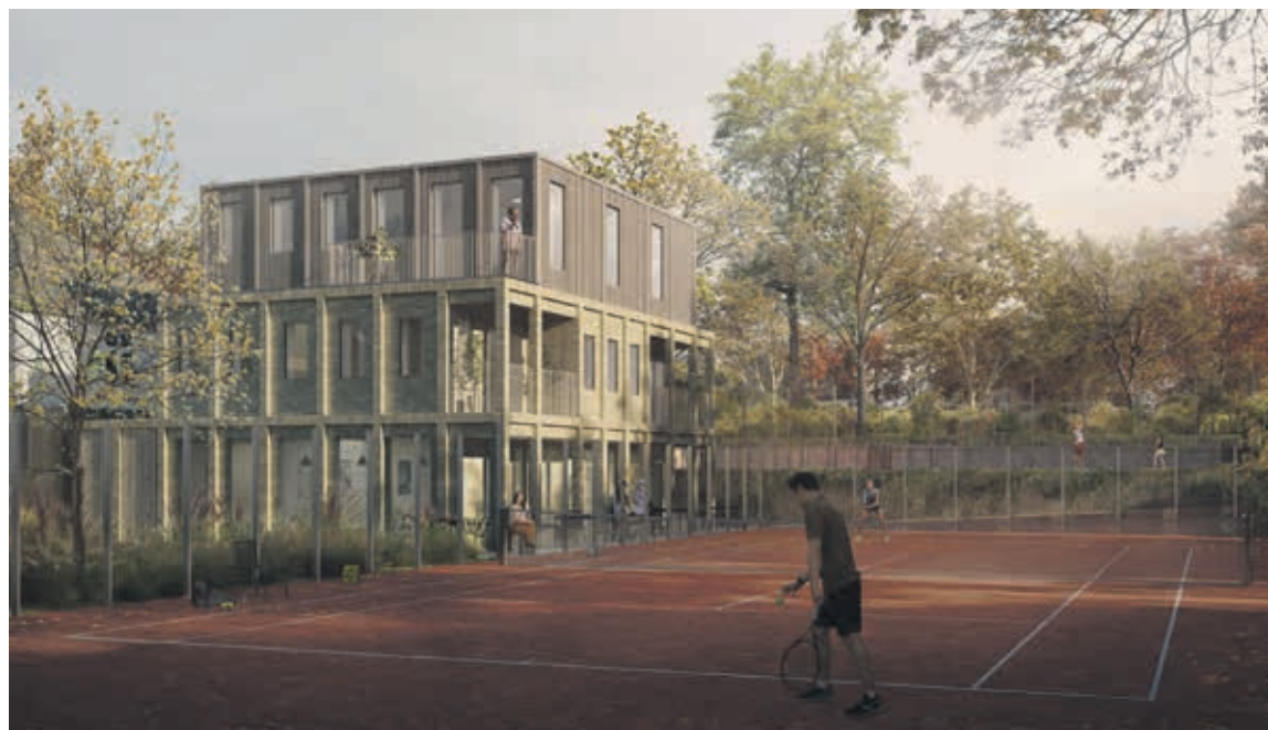
Courtside homes: Architect's drawing of how the tennis club grounds could look.