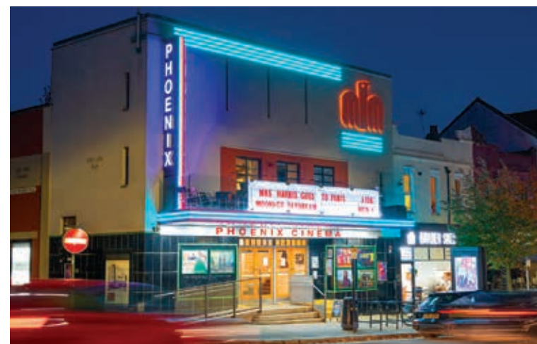
Tough times: The Phoenix needs support

Residents living in and close to Southern Road, N2, were surprised to receive a hand-delivered leaflet last month from a property company outlining plans for redevelopment of the nearby Fortis Green Tennis Club. Read the full story on page 2.