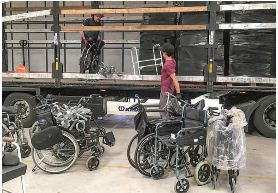
Mobility aids: Volunteers load unwanted wheelchairs onto a lorry bound for hospitals and health centres in Ukraine

he and his neighbours park their cars was often in darkness. Gary claimed this had led to an increase in criminal activity in the area, notably drug dealing. Vans have also been broken into