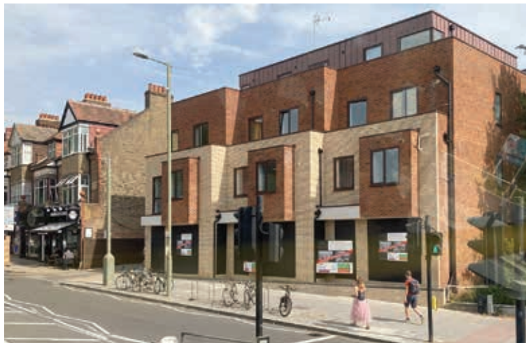
Coming soon: The flats opposite the tube station where the Co-op wants to open a food store

ager at family-run grocery store Tony’s Continental, said: “Do we need four or five big supermarkets moving into a very small proximity? I don’t think so. Everything that they bring is already available on the High Road.” A café owner close to the proposed Co-op site said: “It might