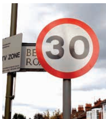
Too much information: The new 30mph sign obscures the Bedford Road street name