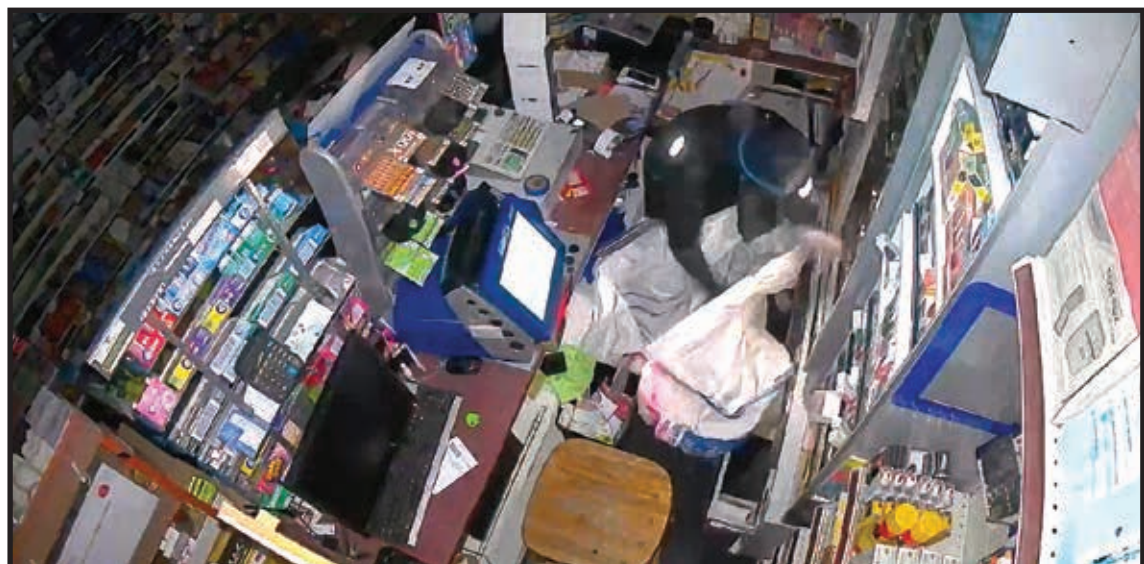
Smash and grab: The Pacey's burglar breaks into a cigarette cabinet and sweeps its entire contents into a huge bag in an image taken from the shop's CCTV footage.

A Bedford Road resident told The Archer : "Since the signs went up, we've been talking of little else." Others added: "This seems completely baffling as we would expect any action to slow traffic rather than speed it up on such narrow streets," and "It's totally irresponsible to encourage 'speeding up' on family roads."