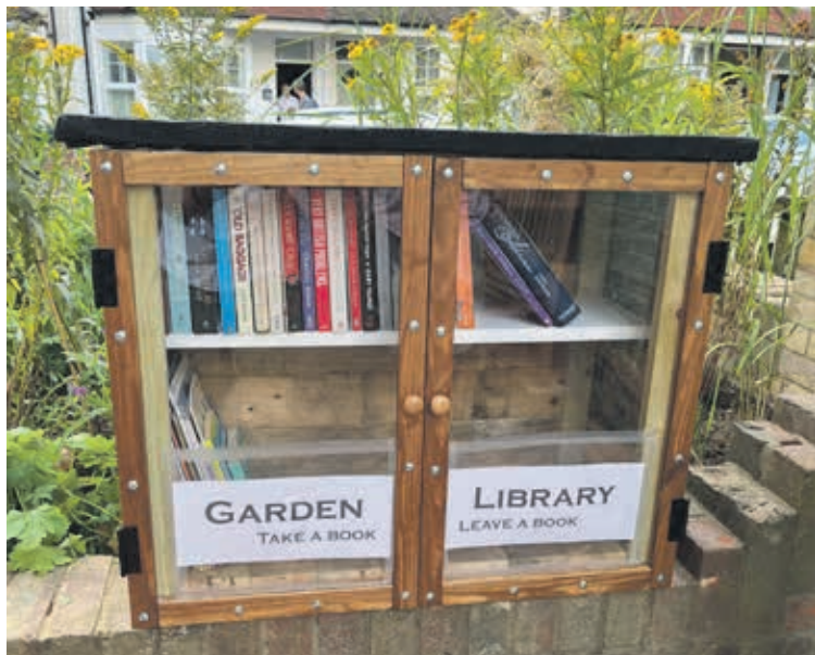
Cabinet of delights: The new book library.

The Friends can be reached any time if there are any queries in advance, or you would like to get involved. Email friendsofcherrytreewood@gmail.com