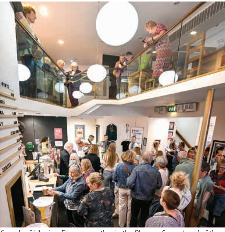
Sounds of Ukraine: Filmgoers gather in the Phoenix foyer ahead of the charity screening.

Letters without verifiable contact addresses will not be printed. Contact details can be withheld on request at publication. We reserve the right to abridge letters for reasons of space.