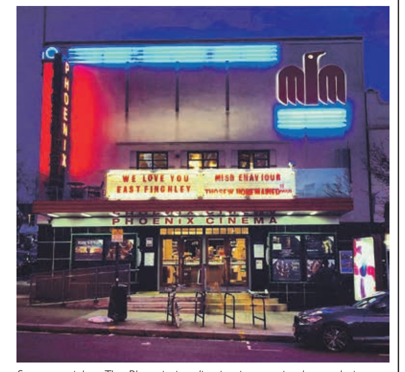
Summer nights: The Phoenix is adjusting its opening hours during August.

It had been reported to Barnet Council on several occasions as posing a risk to people passing underneath it, saying that it was not a matter of 'if' but 'when' it will fall. Hopefully they will now survey this and the other large trees near the Grove, and take preventative action.