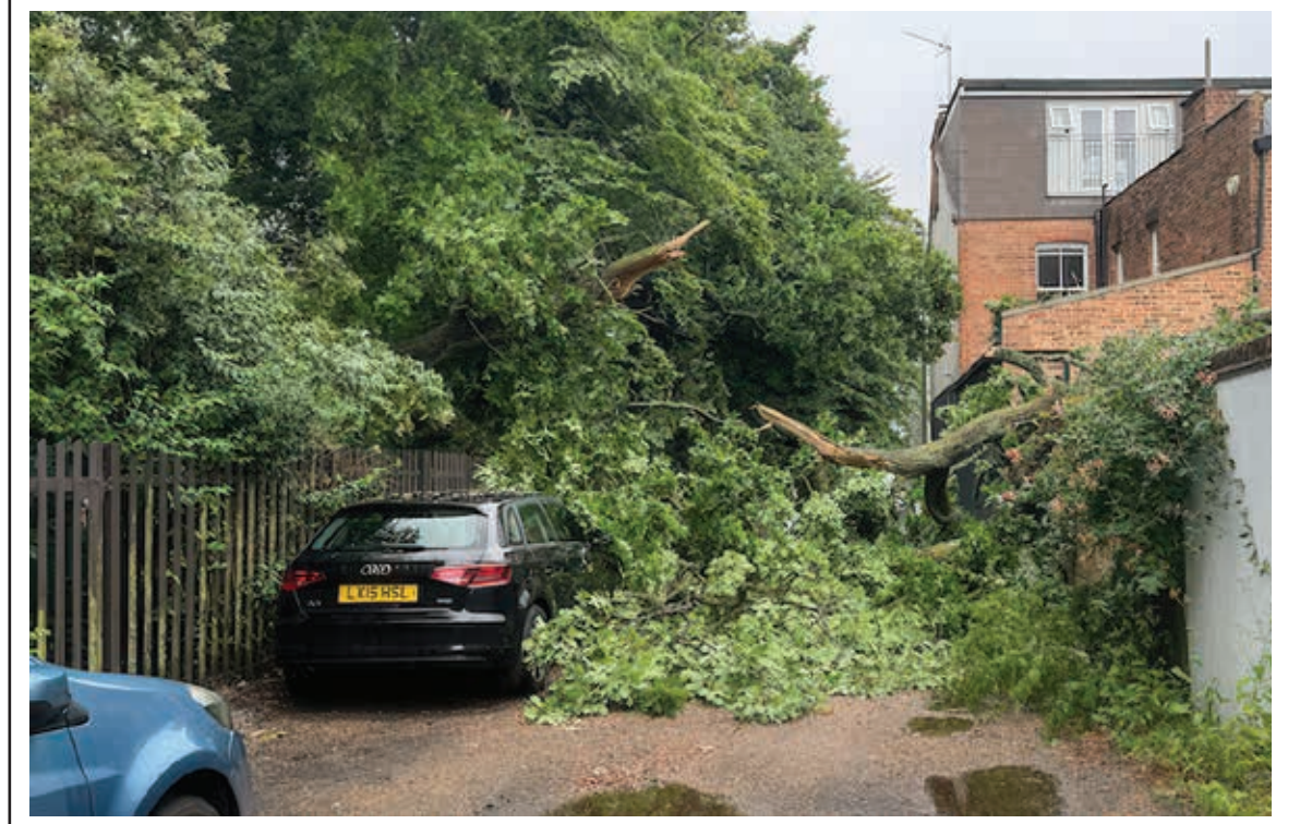
Timber! The huge branch lies across Brompton Grove and a neighbouring garden.

Among the films already slated to run at the Phoenix in August are A Story of Bones, telling the story of