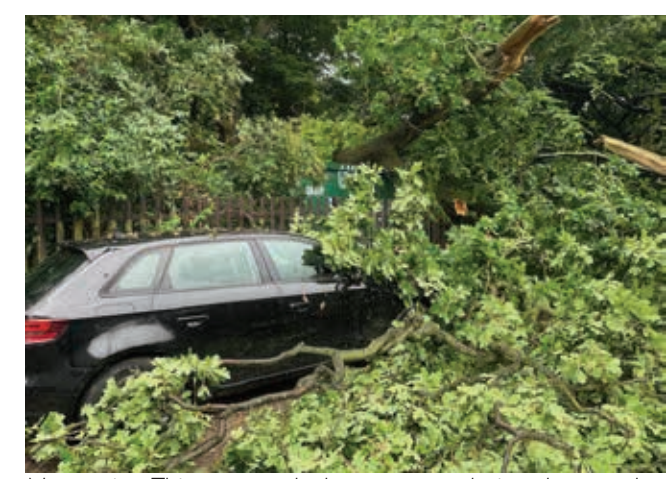
Near miss: This car was lucky to escape being damaged when the branch fell.

Much of what was in the garden was also damaged, including a slide, chairs and a tennis table. It was fortunate that it did not hit the house itself or the story could have been much worse.