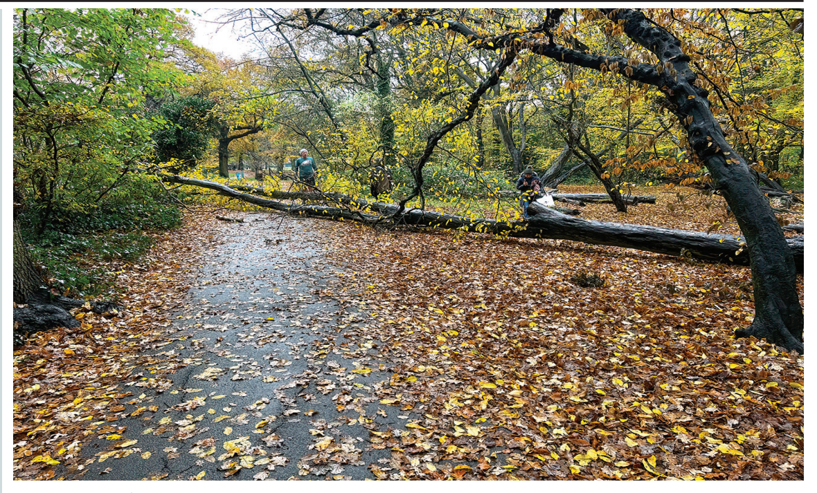
Stricken: The fallen hornbeam lies across the path in Cherry Tree Wood.

Copy deadlines - January: 13 December; February: 10 January; March: 14 February