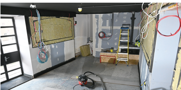
Inner space: The new second screen waits to be fitted