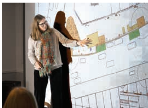
Transformation: Pavement plans on show.

are held at the Constitutional Club, 9 The Walks, N2 8DE at 7pm for a 7.30pm start on the second Thursday of the month. Contact eftownteam@gmail.com for more information.