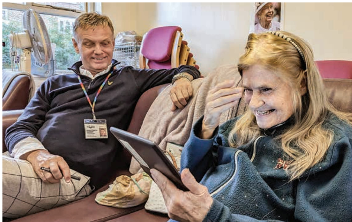
Connected: A guest gets help with her iPad at one of the Age UK digital support sessions

comments about how the wide pavement area between Budgens and Caffè Nero could be improved ( The Archer , August 2023). Local architects Mills and