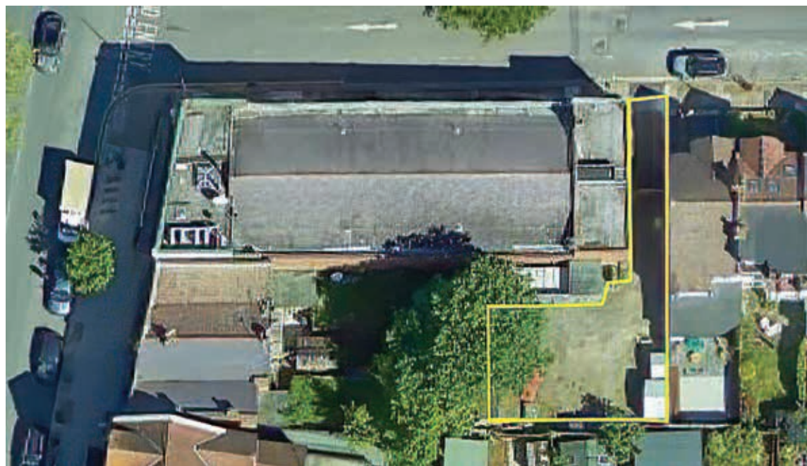
Spare land: An aerial view shows the car park area at the rear of the Phoenix Cinema

Copy deadlines - March: 16 February, April: 15 March, May: 12 April