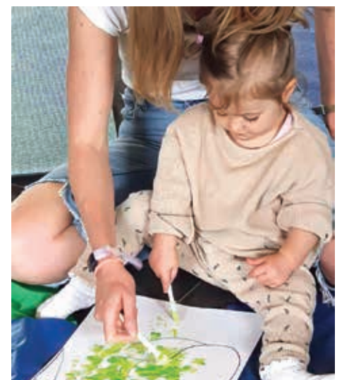
Paper work: A young artist enjoys creating at the Little Yoga Art Club

Some parents may remember them from the outdoor classes they ran in Cherry Tree Wood during