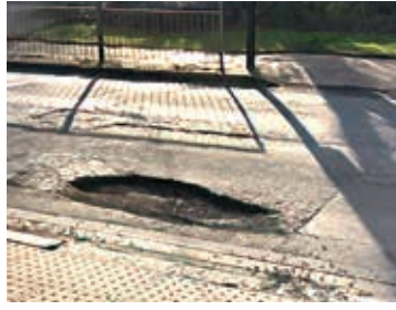
Hazard: The East End Road pothole, since filled in