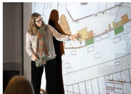
Transformation: Pavement plans on show.

are held at the Constitutional Club, 9 The Walks, N2 8DE at 7pm for a 7.30pm start on the second Thursday of the month. Contact eftownteam@gmail.com for more information.