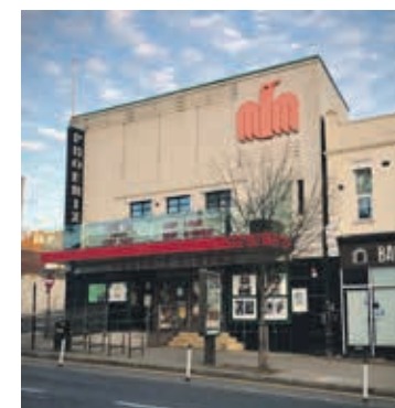
Refurbishment plans: Phoenix Cinema.

“For years it has been sitting there empty, aside from a little bit of storage, so the time has come to make better use of it. We’ve come to the conclusion that selling it hopefully for a good price is the right move and we will certainly be able to make good use of any money it raises.”