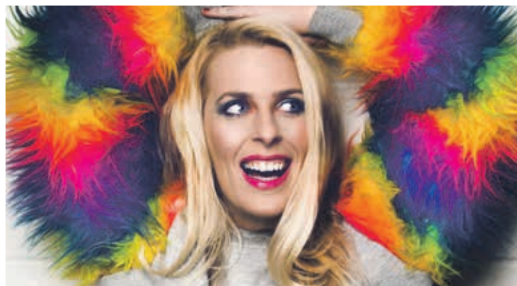
Live on stage: Sara Pascoe

The loss of another local pub was highlighted. The George in Market Place was to be demolished to make way for a development of 14 flats and associated parking spaces. Local residents were becoming concerned about the growing number of housing developments planned for East Finchley, already the most densely populated ward in the whole of Barnet. In the past 30 years at least eight local pubs have been lost to residential development.