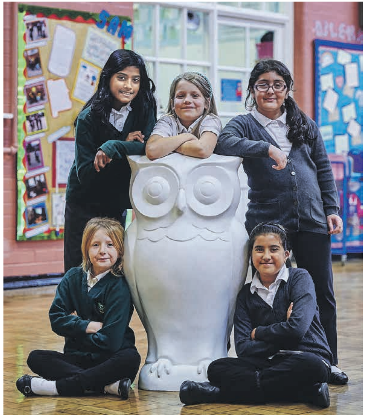
Blank sheet: Schoolchildren stand with a hospice owl ready to decorate.

The innovation of the next generation was inspiring, and in a short time a diverse selection of artistic pieces had been made, all from donated material like old food containers, soft plastics, and unwanted textiles. This was a very successful first workshop and if your school/club would be interested in something similar, do get in touch. Find us at www.bintheredonatethat.org and on Facebook and Instagram @bintheredonatethat