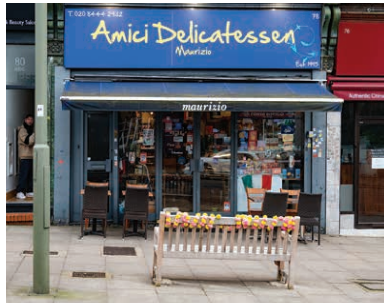
Memories: The family bench faces favourite spot Amici.

Unfortunately, after it had been put in place, Barnet work-