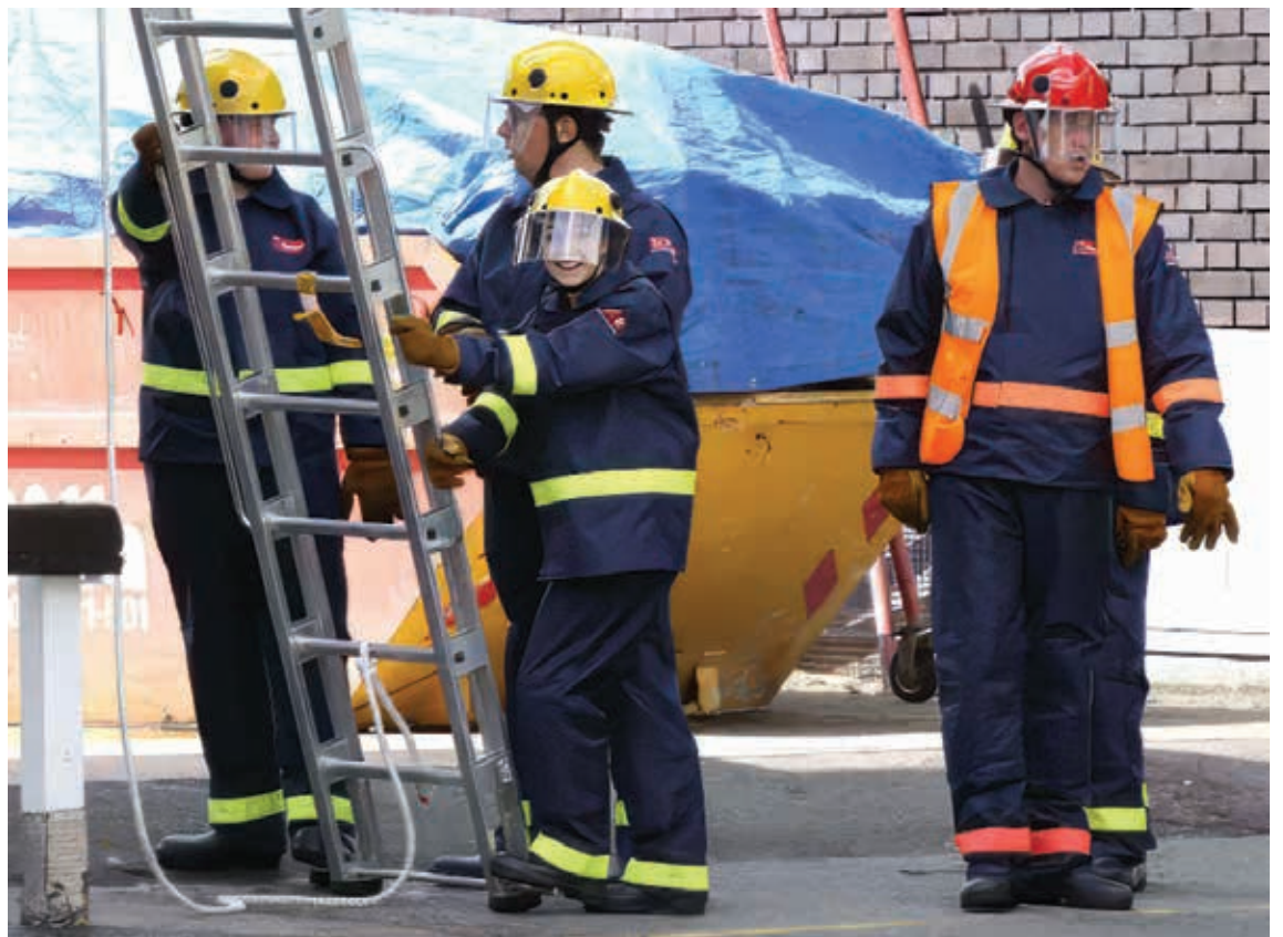
No smoke: A young cadet gets to grip with ladder work at Finchley Fire Brigade