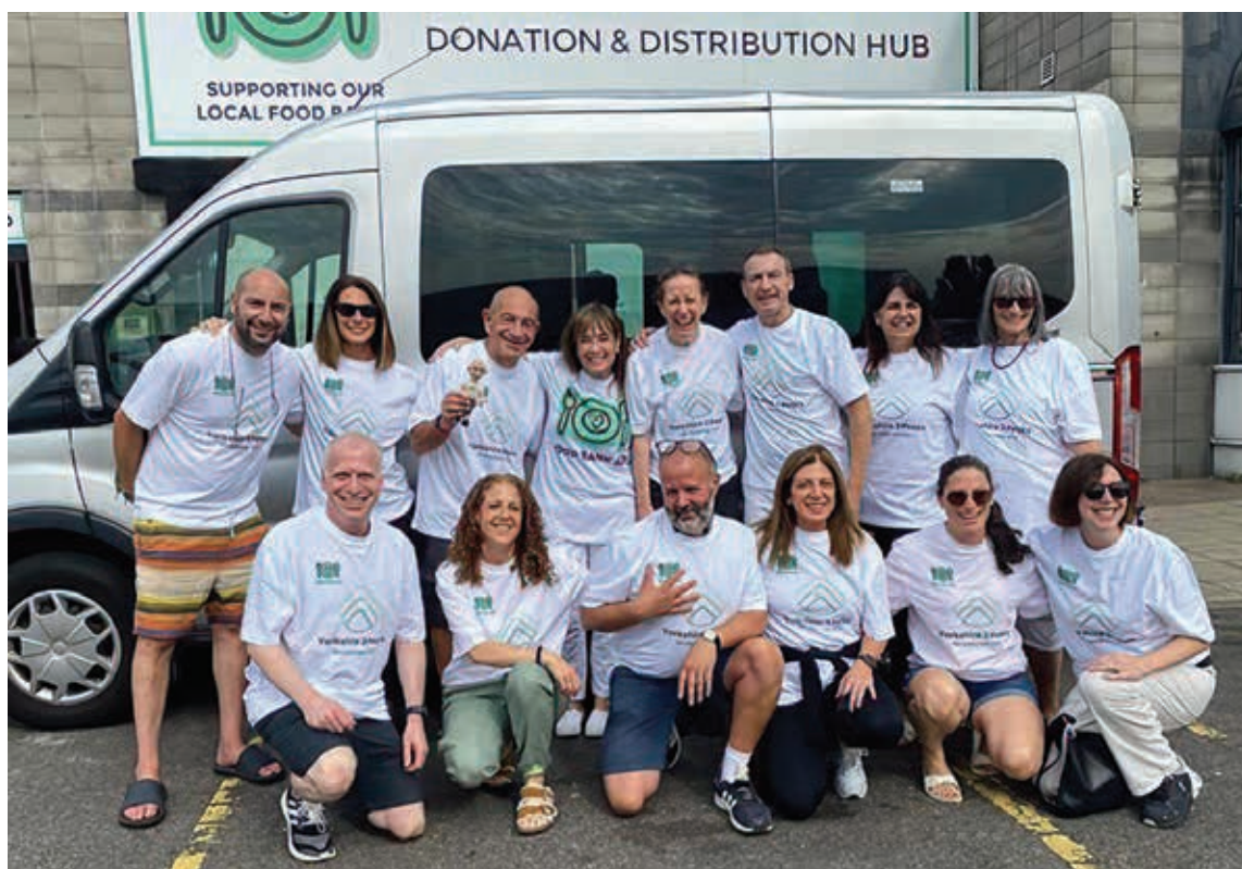
Team work: Food Bank Aid volunteers appeal for donations to support their crucial service

Such screening clinics have been running for a while in Barnet, providing an early warning system for people to act on and so are particularly useful for those who are not registered with a doctor. To find out more, visit barnet.gov.uk/healthscreen .