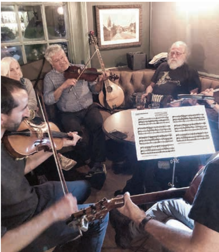
Music makers: Instrument players jam in the Windsor Castle pub.