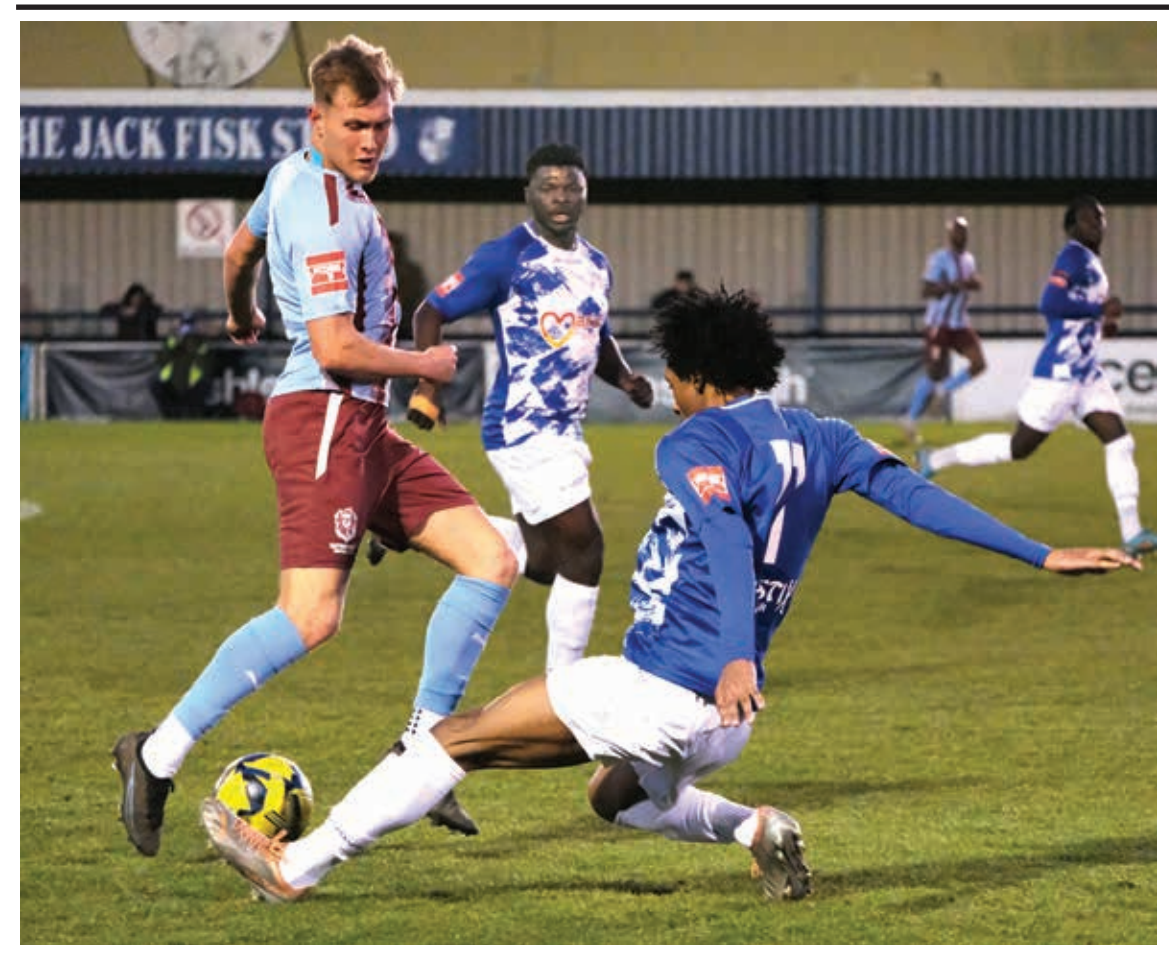
Sliding tackle: Wingate & Finchley, in blue and white, take on Hastings United last season.