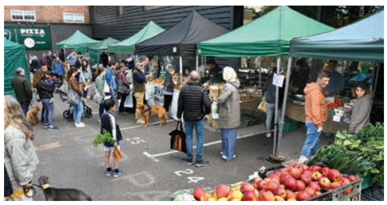
Fresh produce: The new East Finchley farmers market draws customers on its first day.

own way by planting part of the grassland in Manor Cottages Approach, N2, with pollinator-friendly plants. They are inviting the whole community to help them thrive by watering them through the summer. Take along your own bucket or watering can and the nearby Spanners with Manners garage on Long Lane, N2, will let you fill them up from their tap. They also have a watering can to lend.