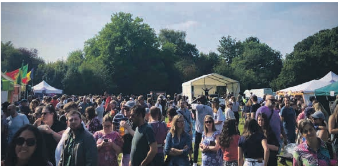
Get Together. Crowds enjoy the 2021 festival under blue skies.

Full details of the 50 th East Finchley Festival can be found at eastfinchleyfestival.org or follow their socials @EastFinchleyFestival