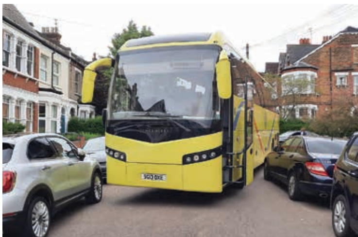
Forward a bit, back a bit: The hapless bus tries to negotiate the tight T-junction