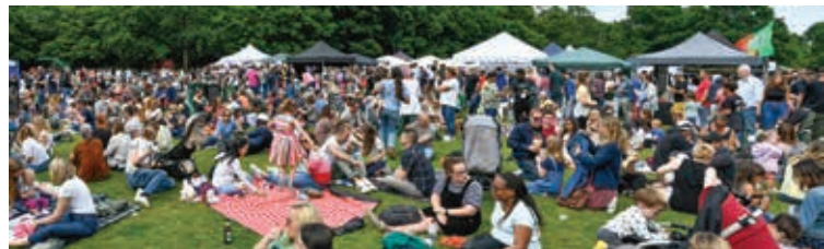
Packed park: Festival-goers in Cherry Tree Wood in 2022

"The new model will make it possible for more local businesses to get involved, and will allow us to offer all our sponsors better visibility for a smaller outlay by adding