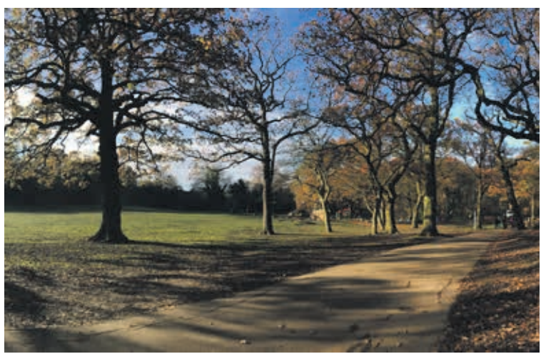
Cherry Tree Wood.

8.5 mile walk East Finchley to Westminster