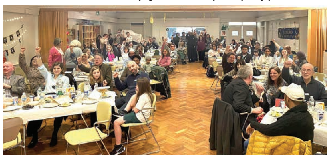
Breaking bread: People of all denominations and none enjoy the lftar meal together.

There followed a delicious vegetarian meal at which the guests were encouraged to speak to people whom they did not know. Some did, others didn't, but it was nevertheless a very lively and joyous occasion.