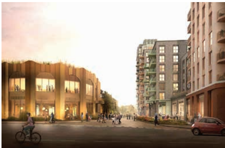
Homes and leisure: An artist's impression of the entrance to the proposed housing development from the High Road

With an eye to environmental responsibility, a green pedestrian route would go through the heart of the scheme, the buildings stepping up in height towards the east of the site and there would be a focus on cycle spaces (2,000) rather than car spaces (300-400). Turn to page 2.