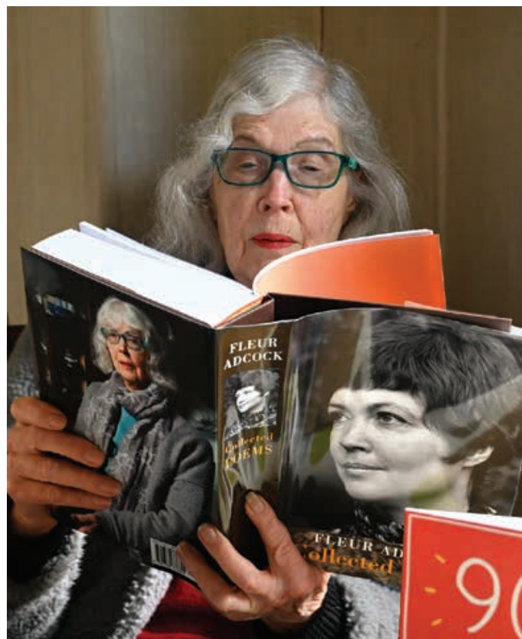
Lifetime's work: Fleur Adcock marking her 90th birthday earlier this year with a new collection of her poems.