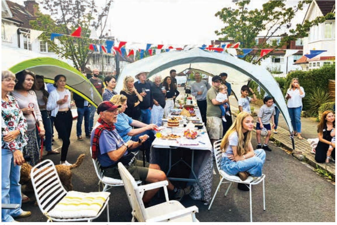
All together now: Neighbours in Cherry Tree Avenue enjoy some of their afternoon entertainment