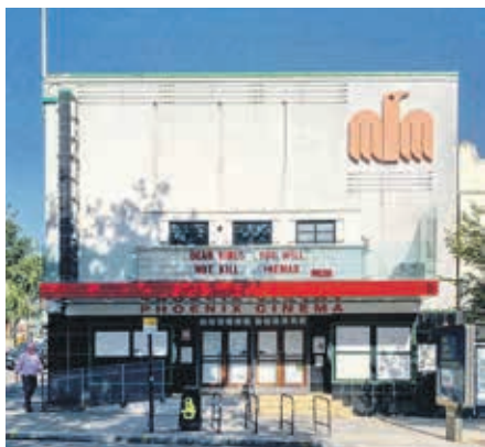
New era: The Phoenix Cinema

Inside the new Screen 2, turn to page 3.