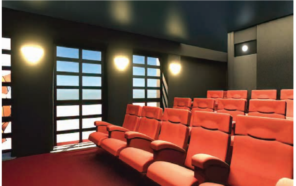
New space: How Screen 2 could look, above, and a plan of how it fits into the café and foyer space, below, plus a side view of the layout, left.

As soon as the second screen is open, currently planned for October, work will start on upgrading the cinema's main auditorium, renamed Screen 1. All the existing 250 seats will be ripped out and replaced with 188 new higher-backed chairs