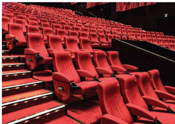
Plush: High-back seating will be fitted in the Phoenix's main auditorium

with more leg room and cup holders incorporated into their arms. There will be two rows of