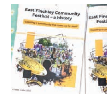
Read all about it: The history of the festival