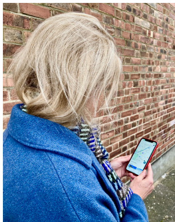
Out in the open: Be alert on your phone

Commuters and pedestrians in East Finchley are being urged to be on their guard against gangs of thieves who are riding into the area on electric bikes to steal mobile phones from unsuspecting users in the street.