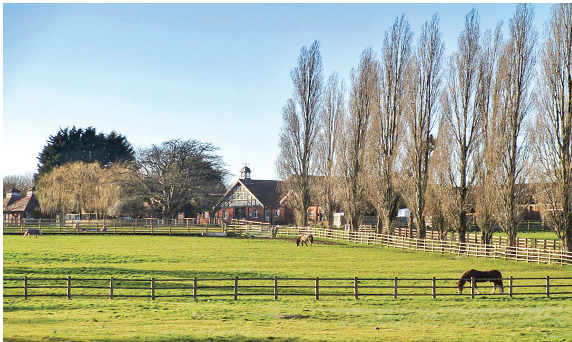
Country in the city: The College Farm fields were open to the public until 2001

Copy deadlines - March: 14 February; April: 14 March; May: 11 April