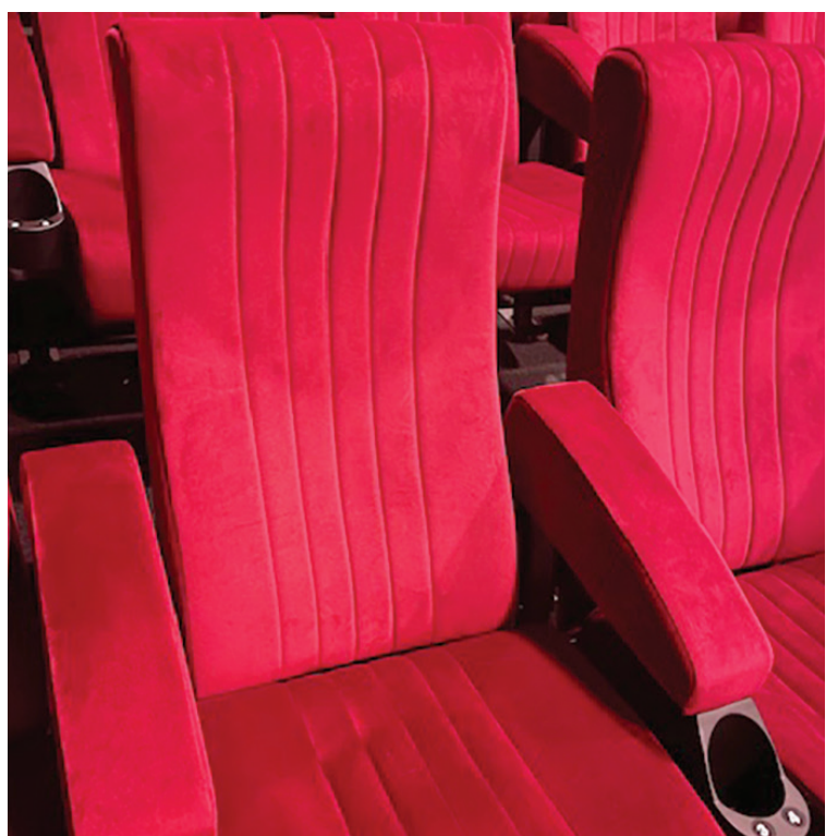
Take it easy: Some like the new seats at the Phoenix, some don't

As the backs are non-adjustable I put my rolled-up coat behind me; my neighbour will bring a cushion next time saying, tongue-in-cheek, that the sleep-inducing angle might be intentional so that viewers have