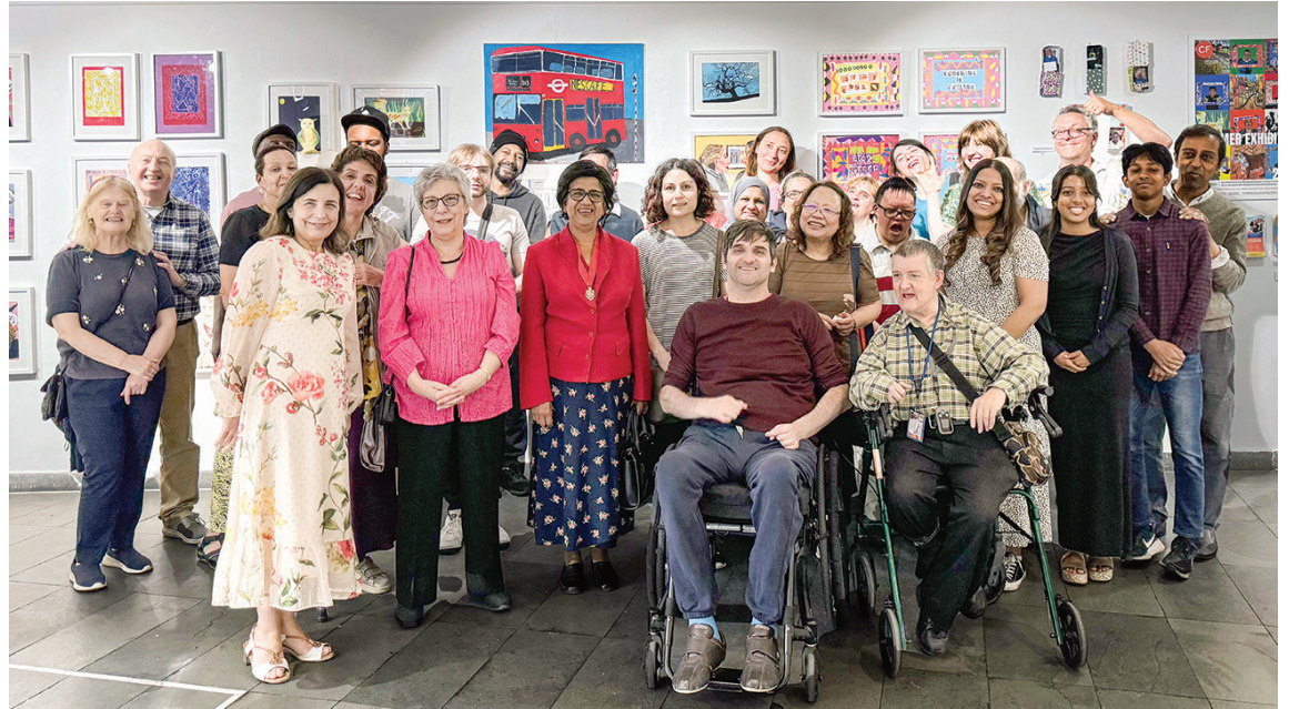
Under threat: Despite doing work that benefits hundreds of people, the Community Focus team is facing a funding shortfall