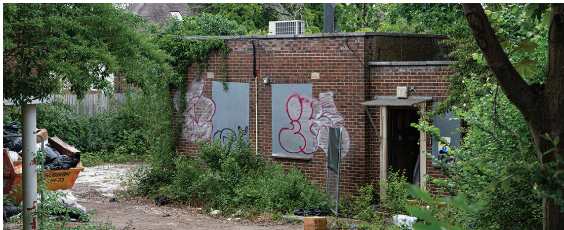
Cannabis factory: The disused Finchley Mortuary off the North Circular.

Copy deadlines - July: 13 June, August: 11 July, September: 15 August