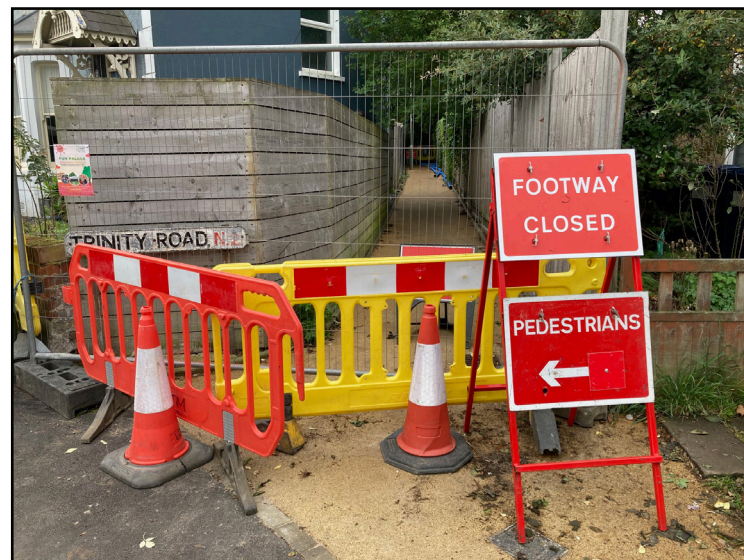
No entry: The pedestrian underpass between Trinity Road and Manor Park Road was still closed to residents in mid-September.

A Grange Big Local spokesperson said: "While GBL has supported the community engagement and design, the construction work is being managed by Barnet Council and permissions from Transport for