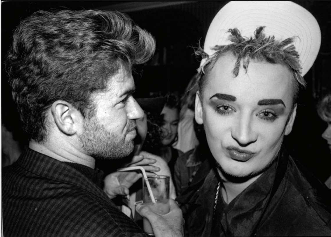
George meet George: of George Michael with Boy George at Limelight