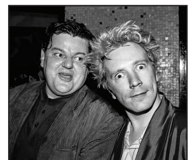
Famous faces: Actor Robbie Coltrane and singer John Lydon