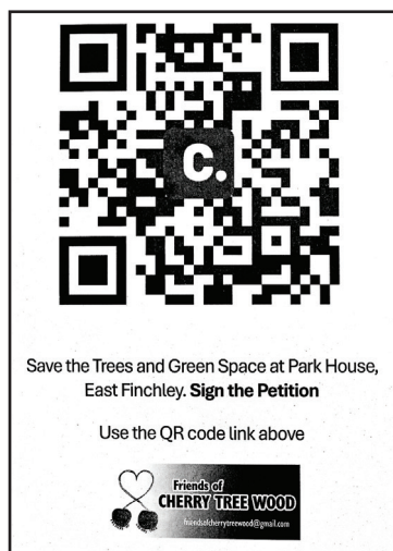
Sign up: Use this QR code to find the petition