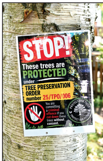
Under threat: Campaigner are calling for the tree preservation orders to be respected

You can access the petition by using the QR code in this article or by visiting change.org and searching 'Save East Finchley Trees'.