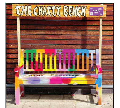
Chatty Bench in the Tarling Road Community Centre

So, if you're out and about and see someone sat on the bench, sit with them and have a chat. You never know how much you could improve someone's day."