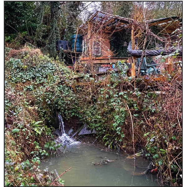
Toxic: A tester, left, examines a sample of water taken from one of the polluted brooks on the East Finchley Allotments site, right.

which has the power to investigate which buildings the waste is coming from, and Barnet Council, which can enforce change, have failed to tackle the problem. We must hold both to account. This failure of coordination is a London-wide problem that destroys biodiversity and harms community wellbeing.