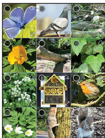
The Nature Club's tick sheet for Cherry Tree Wood

Bishop Douglass High School in Hamilton Road, N2, is hosting its Summer Fair on Tuesday 14 July from 3pm to 5pm . All are welcome to enjoy sports activities, Sponge the Teacher, a bake-off, face-painting, food and games. Tickets will be sold for £2 per family.