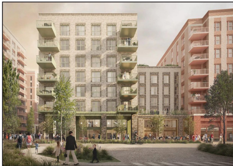
High rise: How the leisure park housing development could look

We constantly hear about the housing crisis from our councillors and MPs, who simultaneously often aren't brave enough to stand up for or debate the nuances of these developments out of fear of upsetting vocal opponents (50% are in support of new housing, per latest YouGov polling). Go just 25 minutes north of the site and you're in the Green Belt, where the opposition is just as vociferous by a minority. There seems to simply be nowhere new housing doesn't encounter NIMBYism, a seemingly quintessential human trait. In a world that seems so divided, what are we to do?