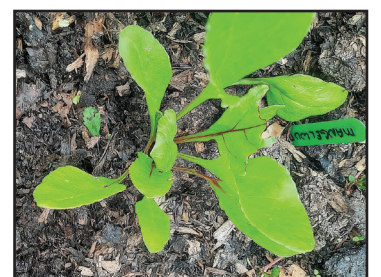
A young plant starting to thrive