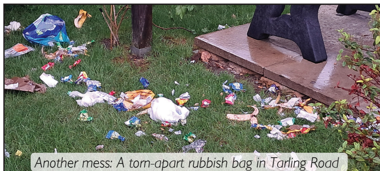
Another mess: A torn-apart rubbish bag in Tarling Road

A number of years ago, local residents turned a small plot on Tarling Road into a garden, with the help of lottery funding. For decades, it had been used as a dumping ground for old mattresses, chairs, tables, etc.