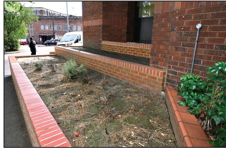
Bare earth: The flowerbeds on the High Road.

The flowerbeds outside the McDonald's HQ in East Finchley are in a really poor state. The extended section nearest the Tube station has remained unplanted since the steps were removed. Litter is everywhere.