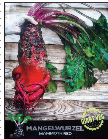
Thing of beauty: A full-grown mangelwurzel

The mangelwurzel is a largely forgotten heirloom vegetable halfway between a sugar