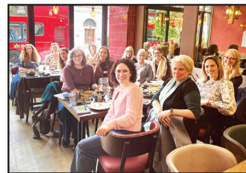
Members of The Switch Network

the constant creative banter that came with it. When I stepped away to raise my daughters and began exploring what came next, I knew I wanted to build