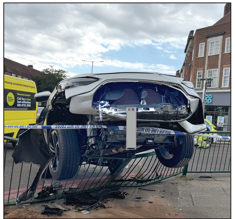
Two cars are wrecked after colliding with the metal barriers at the junction of Ossulton Way and the A1.

creates confusion and encourages dangerous driving.