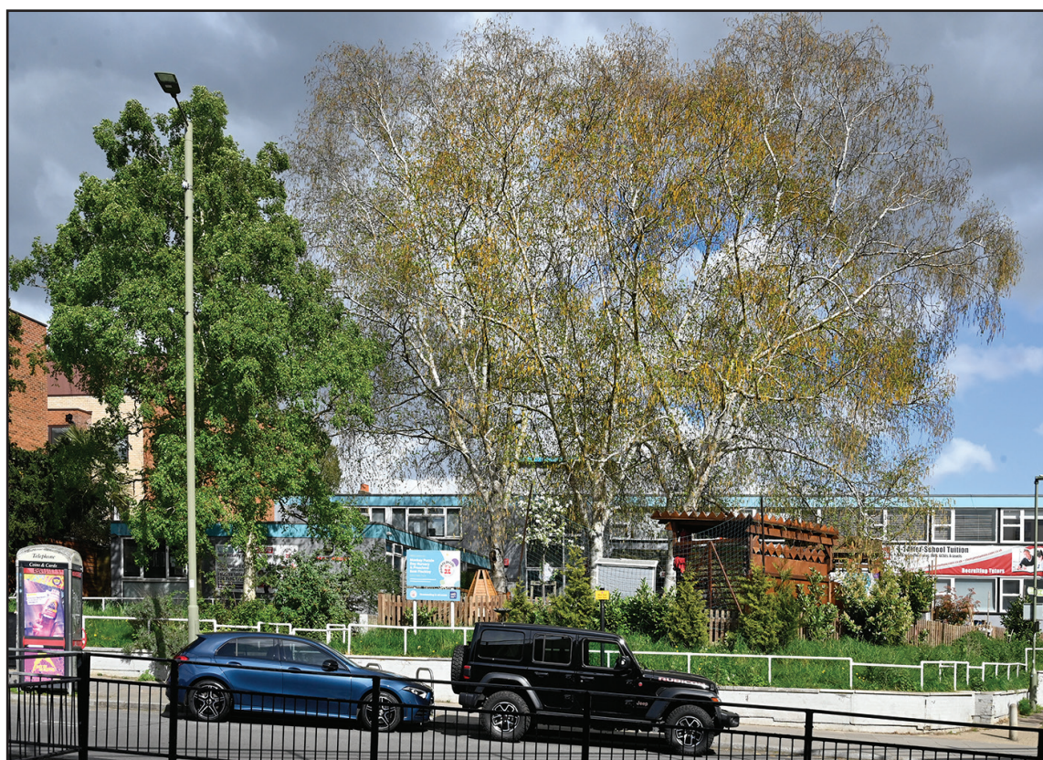
Under threat: The trees at the front of the Park Road site.