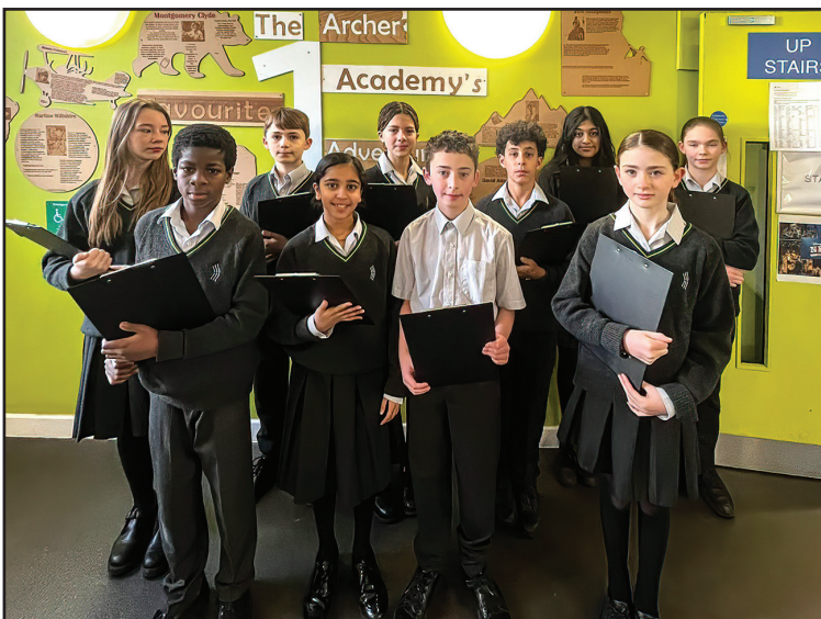
Ready to report: Year 7 journalists at the Archer Academy prize giving

Every autumn, Archer hosts its annual Prize Giving Ceremony to celebrate students' achievements from the previous academic year. This year, we were thrilled to be part of the 'Year 7 Young Reporters' team, where we not only attended the exciting ceremony but also had the opportunity to interview award winners, their families, and special guests.