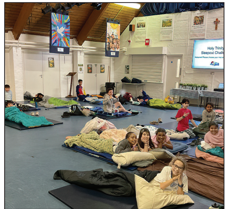
Sleep in: Holy Trinity pupils bed down in the school hall for the fundraising event

Year 5 and Year 6 pupils and teacher volunteers slept overnight at Holy Trinity Primary School on a Friday night in February to raise money for the Church Urban Fund, which supports homeless people by giving them food and temporary shelter overnight.